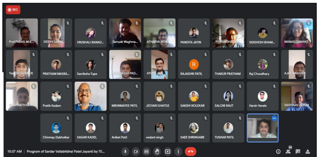
Program of Sardar Patel Jayanti-2021 by TESA-SPCE