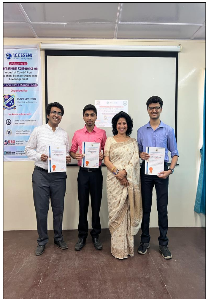
Paper Presentation by B.Tech. Mech. students in International Conference ICMAPE-2022 , Mumbai organised by Science Plus .